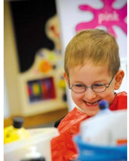
Left: Visual Art has a unique place in our curriculum