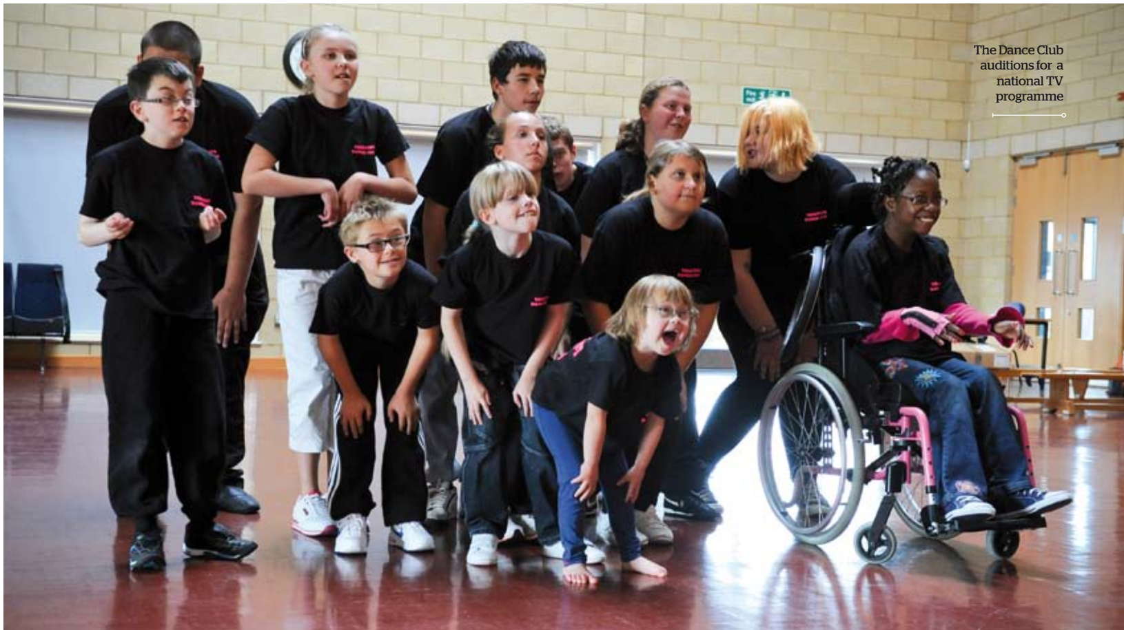
The Dance Club auditions for a national TV programme